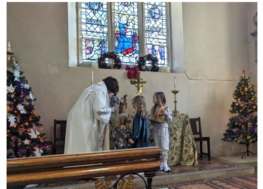
Wise men start their journey to Bethlehem

Thank you to everyone who contributed to making this a inspirational season and offering the legendary St Mary's welcome to all those visiting the church.