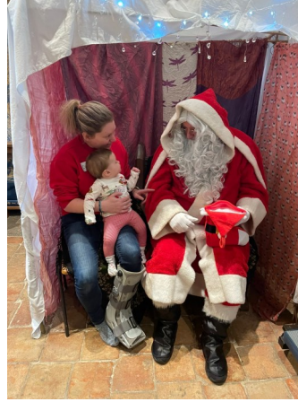
Father Christmas visits Coffee Pots & Tiny Tots