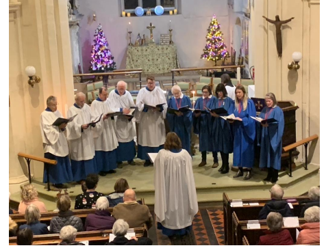
Carols by Candlelight