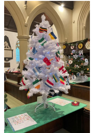
Christmas Tree Festival Winning Tree