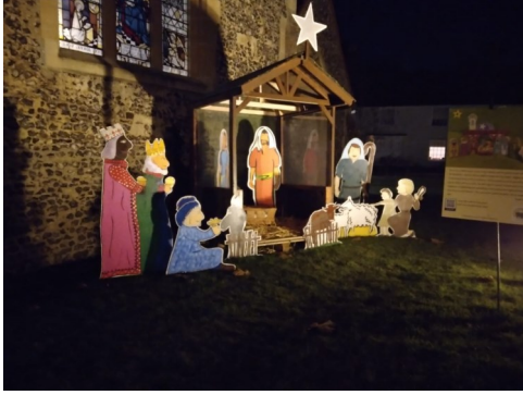
Walk to Bethlehem—The Stable Scene

Here is a small sample of all that went on at St Mary's Church over the Christmas period. It was lovely to see so many people involved in worship and events.