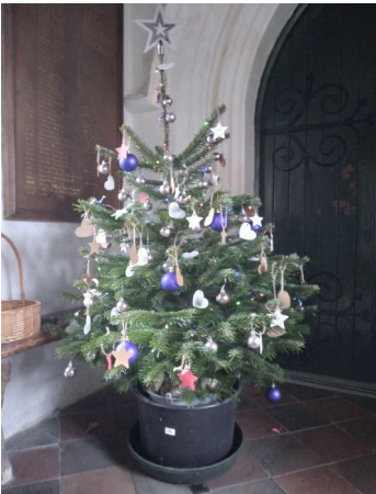
The Memory Tree—full of messages of love and hope